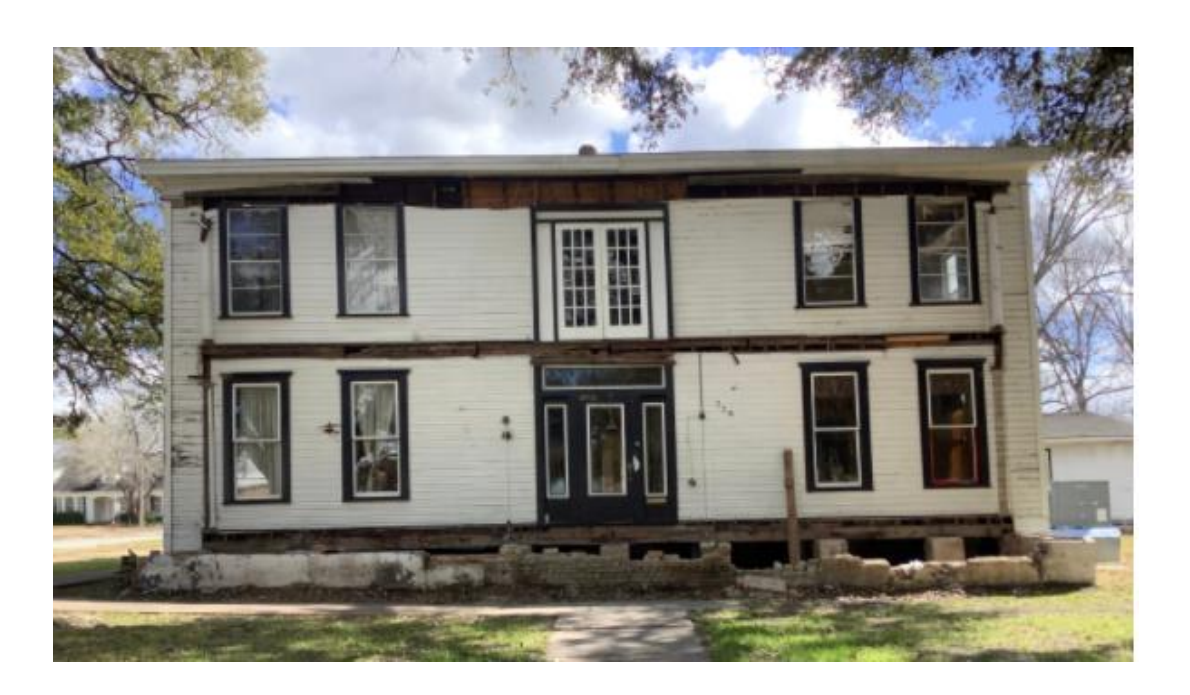
Right side by Dairyqueen: