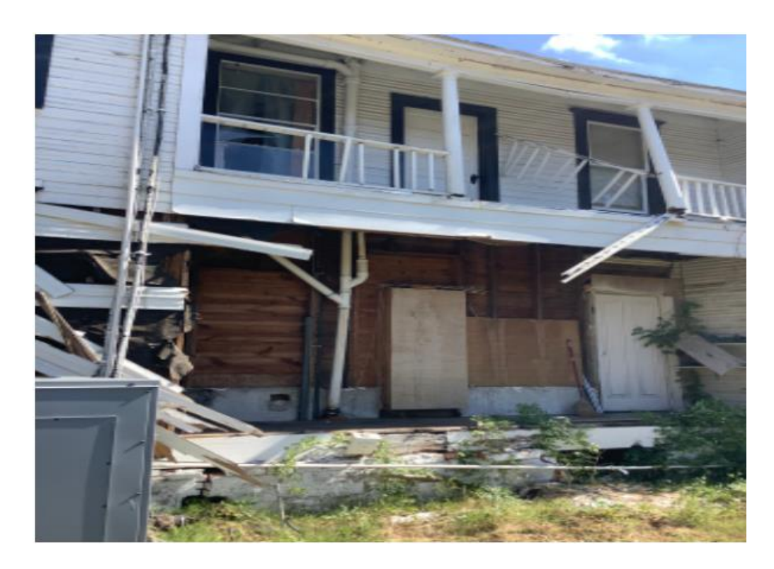
Rotten wood and termite damage on upper rafters: